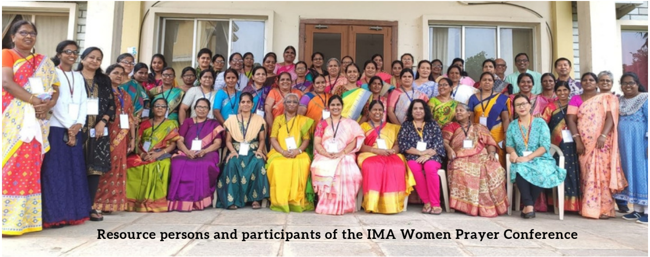
Resource persons and participants of the IMA Women Prayer Conference