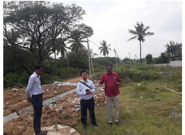
The plot of land for IMA Office in Bengaluru