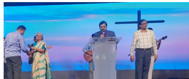
Felicitation of the families